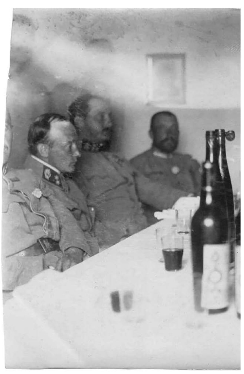
Palú del Fersina, 1914. Museo storico della guerra di Roveretto.